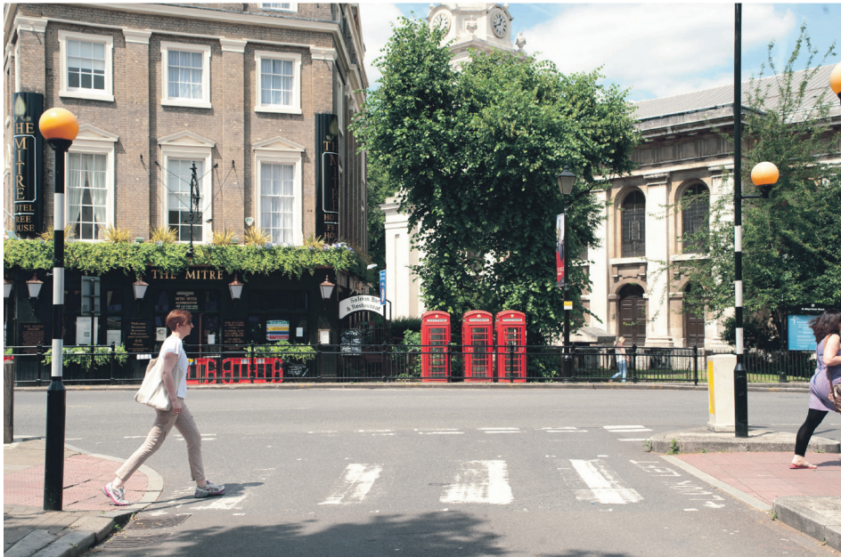
Can you spot the difference?

There's so much more that an optometrist can learn from an eye examination than the prescription for your new glasses or contact lenses. Armed with the most advanced technology, the optometrist will be able to look for the early signs of disease — especially important if you have a family history of glaucoma, age-related macular degeneration or diabetes.